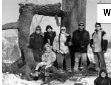
Winter Nature Walk