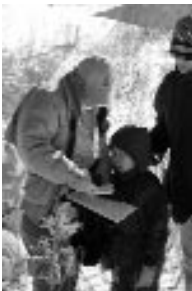
Cory getting schooled